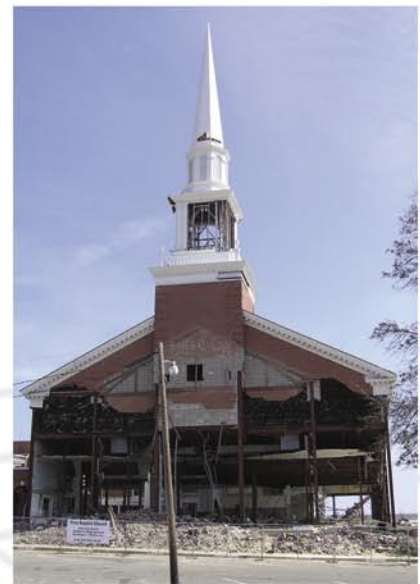
Six months after the hurricane, you can still see the devastation all along the Gulf Coast.

To learn more about Modine's products and the communities it serves, go to www.modine.com .